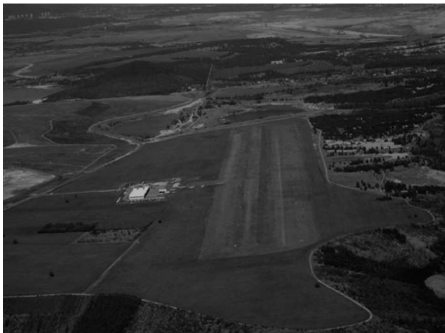
FIGURE 3. The restoration of dump surface (locality Strimice)