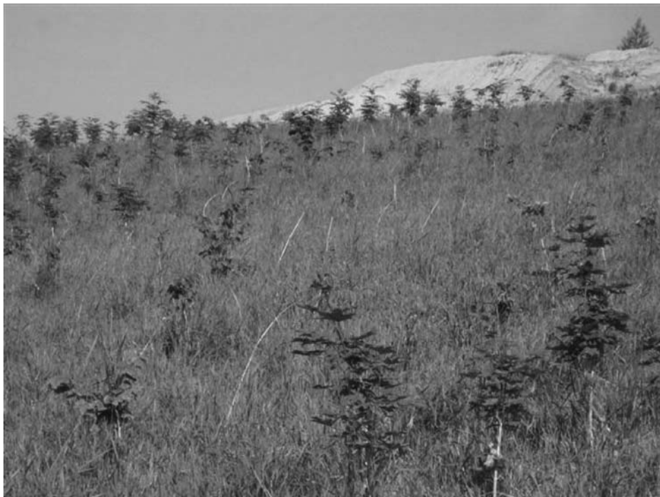
FIGURE 4. The experimental area after application of the power plant stabilizer

The experiment proved substantial improvement of sterile coal clay stones properties and the method is, because of great production of the stabilizer, very prospective. Before it is used in practice other, more extended tests in wider areas will be needed. Current status of the experimented area is shown in the FIGURE 4.