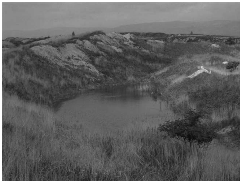
FIGURE 5. The situation of areas retained to natural succession

natural succession were selected after the thorough survey of not reclaimed part of the dump (about 670 ha) which consisted of field mapping, evaluating of upper soil profile by boring rod and laboratory analysis of selected samples. Dump exposure can be seen in FIGURE 5.