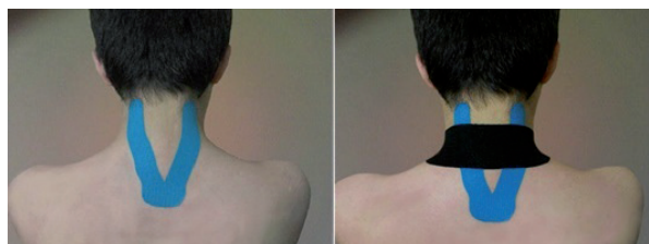
Figure 2. Application of neuromuscular taping with muscular inhibitory technique Y cut (blue taping), and space technique with I cut (black taping).

Definition of the interventions (independent variables): The physiotherapy treatment included damp heat and high frequency (100 Hz) modulated type TENS (Transcutaneous Electro Nervous Stimulation) simultaneously for 20 minutes, sedative massaging throughout the cervical region for 15 minutes, and TFNMP (Proprioceptive Neuromuscular Facilitative Techniques) specifically rhythmic stabilization on the cervical spine 13 . For the application of the neuromuscular tape, a Y-cut was made for the inhibitory muscular technique with a tension of 10% (paper tension) applied on the cervical muscular extender that presented muscular spasms, based at the first thoracic vertebra and anchored at either side of the upper end of the neck ( Figure 2 ).