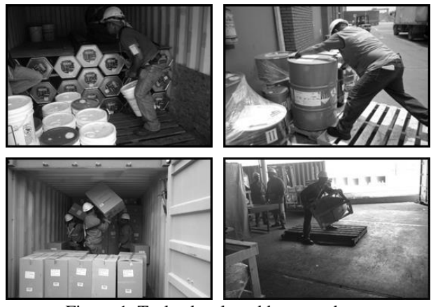
Figure 1. Tasks developed by stevedores

neither positive nor negative impact on the customers' perception. According to the results of RAM matrix, the researchers found that stevedores have the risk to suffer scoliosis level 2, low grade. For this reason, improvements should be made in the already established control systems. Regarding the induction plans, procedures and work instructions; a better operative steps sequence should be established to realize the activities in a safe way.